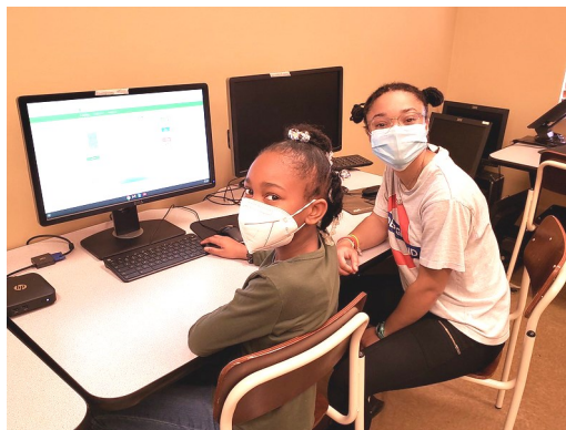
HoneyRock GAP Students serving with the IHS S.P.A.S.E. Afterschool Program

fresh vegetables for local families and it is a source of income for summer youth workers. It also serves as a teaching tool on healthy eating.