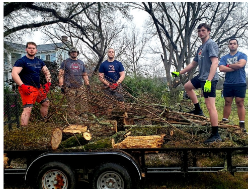
Wheaton College Football Team serving at the IHS Agape Campsite