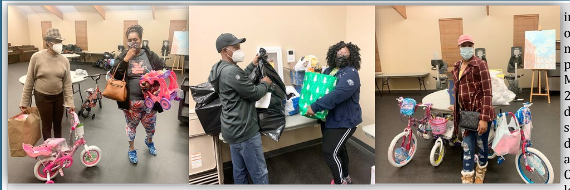
IHS Compassion Store volunteers and recipients