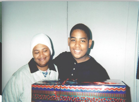
1996 Ministry to families of recently released incarcerated youth