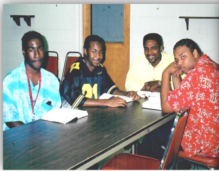
1994 Ministry to recently released incarcerated youth through recreational activities

“I was involved with mentoring a young man in Brandon, MS who I called often and took to church every weekend. My passion for this ministry was just knowing that I wanted to make a difference in these young men’s lives.”