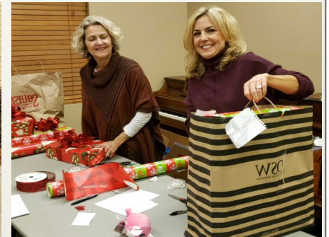
First United Methodist - Canton