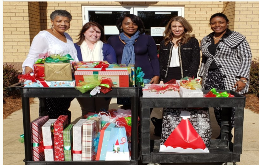
Mississippi Community College Board