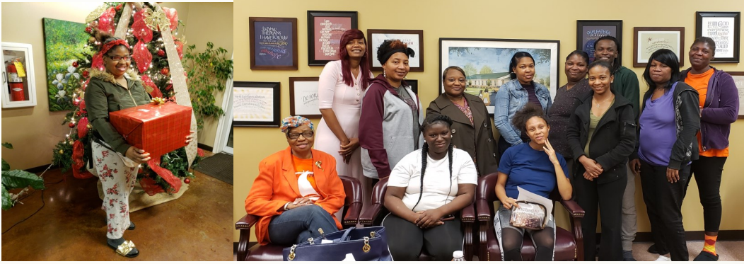
Over 30 Families were impacted through the IHS 2018 Compassion Store

Leviticus 19:9-10 says, "When you reap the harvest of your land, do not reap the very edges of your field or gather the gleanings of your harvest. Do not go over your vineyard a second time or pick up the grapes that have fallen. Leave them for the poor and the foreigner. I am the Lord your God."