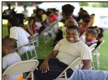
Saw Mill youth enjoying Family Fun Day