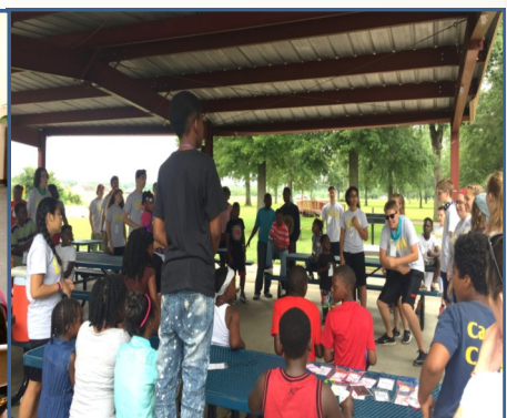
Grace Community Church VBS at Roger's Park