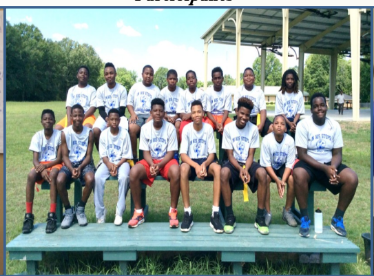
Football Camp Participants