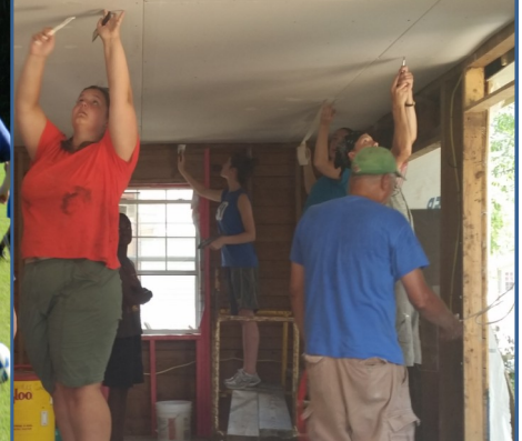
Lanesville Home Renovation Service Project