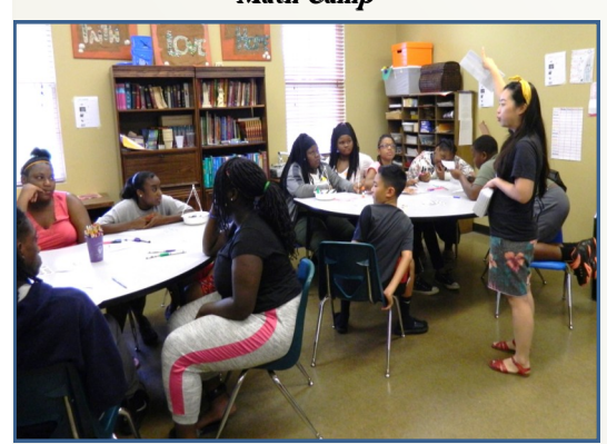
Good News Chapel Summer Enrichment