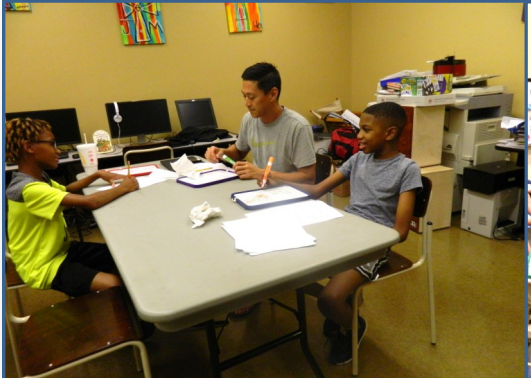
Crossway Community Church Math Camp