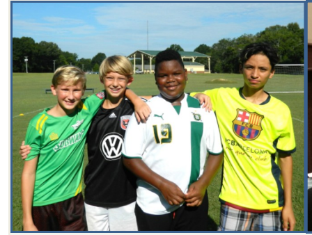
Friendships built through Soccer Camp