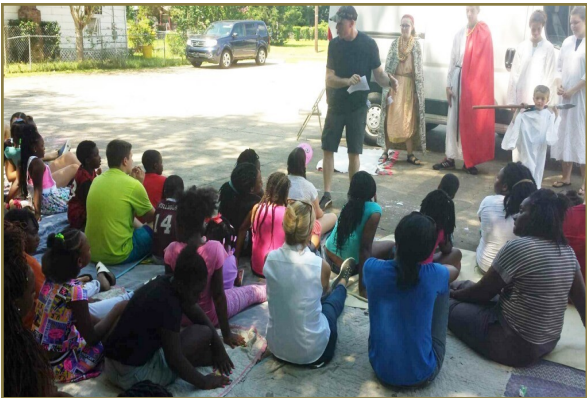
Orthodox Congregational Church of Lanesville (Gloucester, MA) performs a biblical skit during VBS