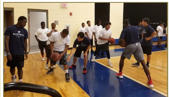
Crossway Community Church mission team giving drill instruction during Basketball Camp