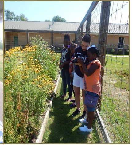
Grace Community Church Access Mission Team conduct a class in photography