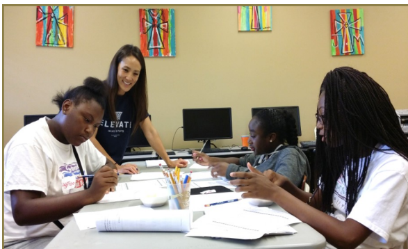
Crossway Community Church mission team conducting Math Camp at IHS