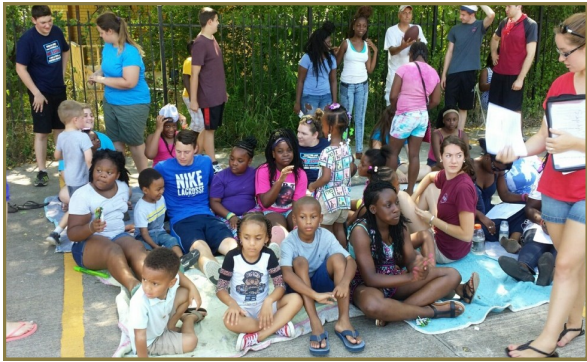
Orthodox Congregational Church of Lanesville & Holy Trinity Anglican Church (Madison, MS) doing VBS in the Sawmills Quarter