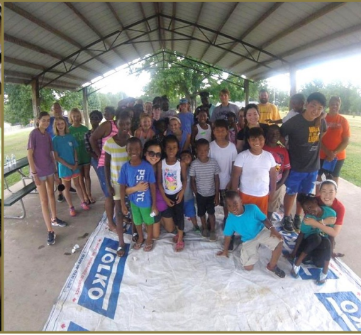
Good News team conducting VBS at Red Bud Park