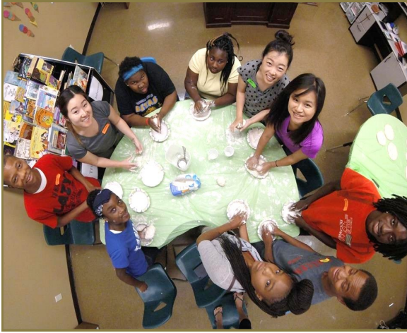
Good News Chapel (Walnut, CA) mission team conducting summer enrichment activity