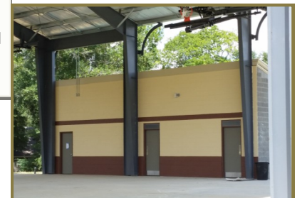
Meeting room & restrooms at the pavilion

well as an open ended writing prompt. The results of the diagnostic assessment was used to guide instructional practices for the remainder of the program. The 26 elementary and middle school students were also able to participate in leadership, photography, music classes, and daily devotions as well as physical exercises. Overall, this was one of the best summer enrichment programs ever.