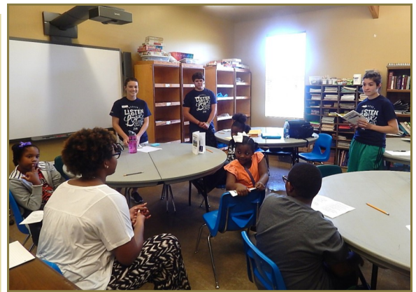
Grace Community Church Access Mission Team (Noblesville, IN) instructing a summer enrichment class

At the end of the week, Christ Kingdom had been expanded, new friendships were built and God was glorified (Mark 5:14). Thank you to the many volunteers who help IHS be a light in our community.