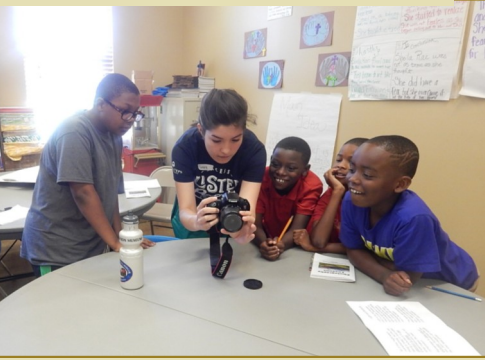
Grace Community Church Access Mission Team instructing the students in the art of photography